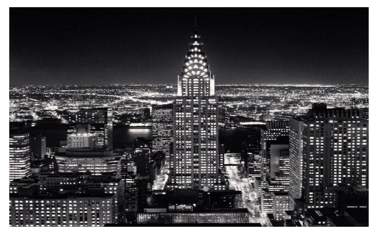
Michael Kenna, Chrysler Building, Study 2, New York, New York, USA, 2006