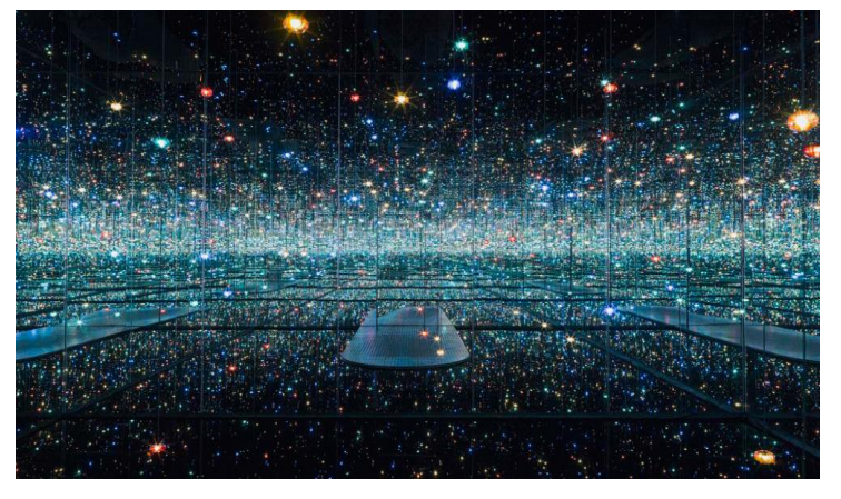
Yayoi Kusama, Infinity Mirrored Room- The Souls of Millions of Light Years Away, 2013