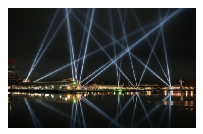
Rafael Lozano-Hemmer, Articulated Intersect, 2011