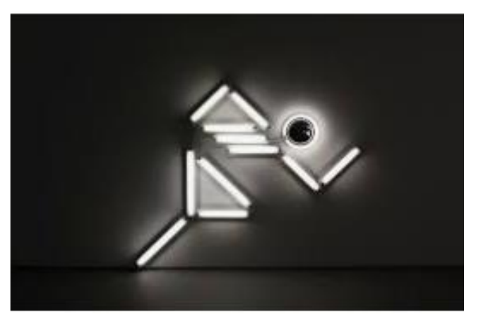
Light Sculpture by Iván Navarro